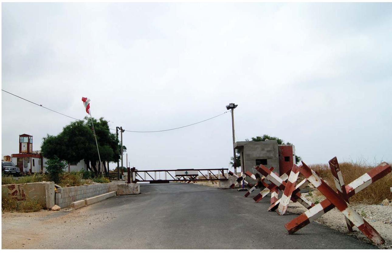
LAF checkpoint close to the Blue Line, towards the south of Naqoura.

commitment and negotiation at all costs. It was to be the seed of the next big crisis.