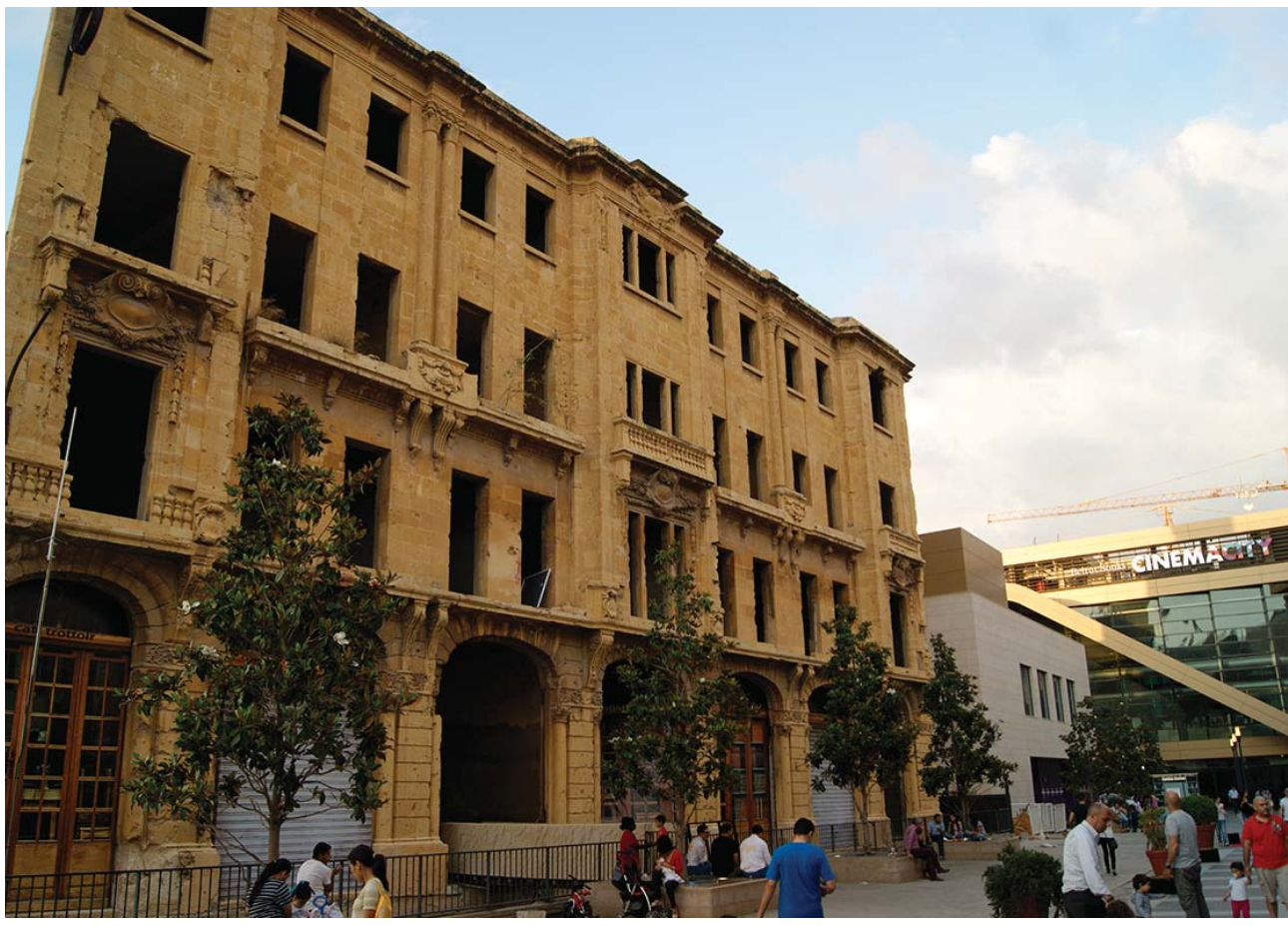
Beirut and the coexistence of the old and the new.

Israeli incursions, such as Operation Grapes of Wrath in 1996, did not cease either.<sup>11</sup>