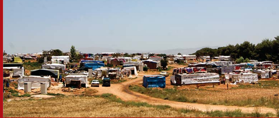
Roman ruins in the city of Tyre in a state of abandonment. Lebanese Armed Forces checkpoint in the south of the country. Makeshift camp for Syrian refugees in the Marjayoun region.