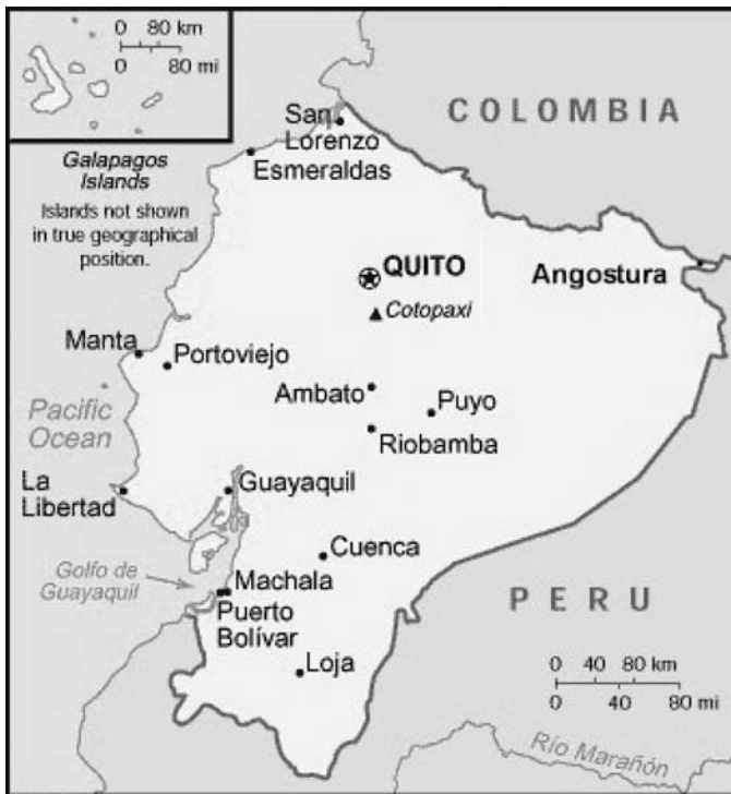
Map 1. Ecuador.

a camp of the terrorist-narco-trafficking Revolutionary Armed Forces of Colombia (FARC) 1.8 kilometers inside the border in a difficult jungle area of Ecuador known as Angostura. 2 The target of the attack was long time FARC leader Raúl Reyes ( nom de guerre for Luis Edgar Devia Silva), who was killed along with 24 others (including four Mexicans and an Ecuadorean). 3 (See Map 1.)