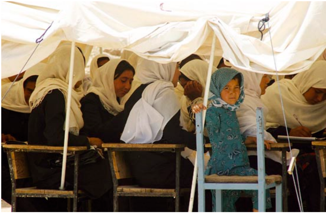
Girls' school in Afghanistan.