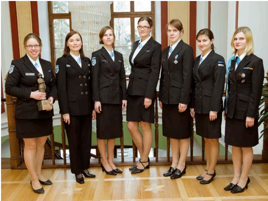
Members of the Estonian women's voluntary defence organization at the awarding ceremony of 2011.