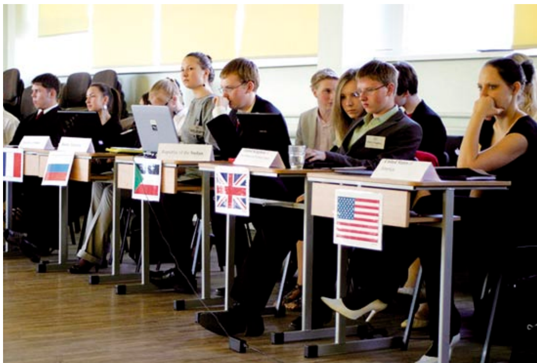
Among the Millennium Development Goals, the UN simulation exercise introduced also the aspects of UN Resolution 1325.