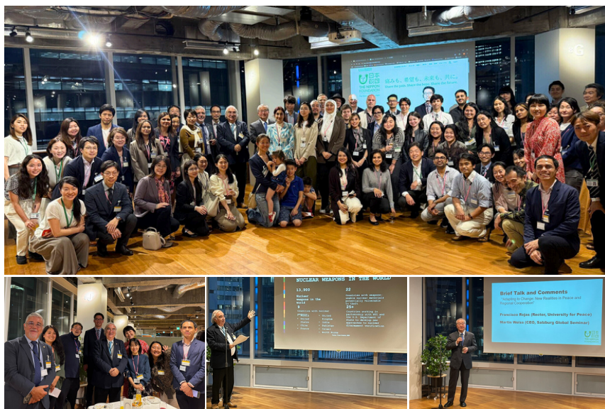
Pictured: The Rector and Vice Rector together with representatives of The Nippon Foundation, Alumni and representatives of the Hiroshima Peace Institute during the mission to Japan.

UPEACE Partners in National Effort to Combat Illicit Trade and Organized Crime