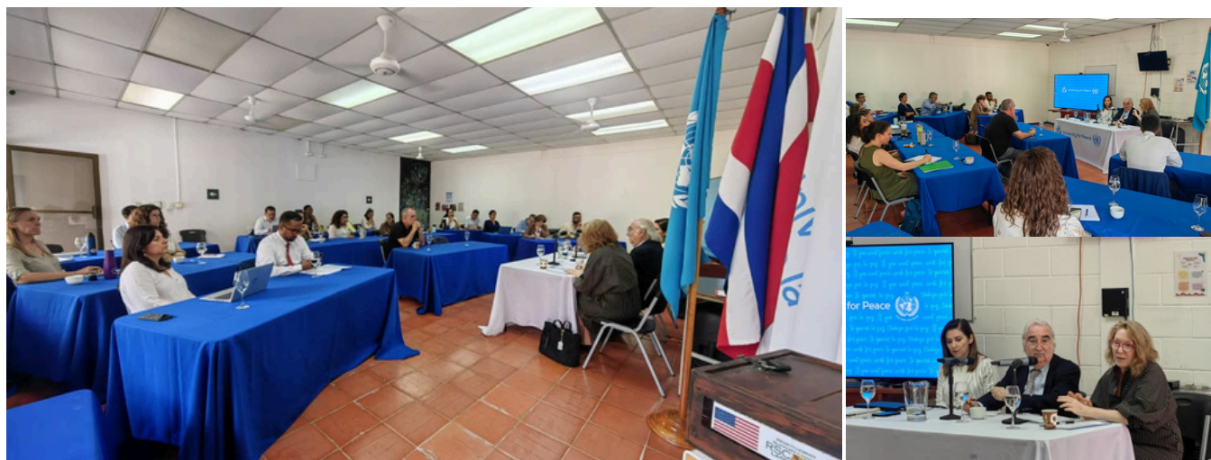
Pictured: UPEACE faculty, academic staff, and representatives from the Regional Offices during the academic retreat held on the main UPEACE campus in Costa Rica.

This week, faculty and academic support staff at the University for Peace engaged in an enriching academic retreat aimed at analyzing the evolving global landscape and designing curricular adjustments to ensure the relevance of our training programs.