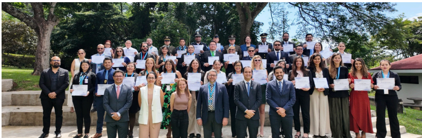
Pictured: Authorities from the organizing institutions alongside participants of the second cohort of the Academy.

With immense pride and enthusiasm, we celebrated the graduation of the second cohort of the International Academy for Specialized Training on Human Trafficking and Smuggling of Migrants at the main University for Peace (UPEACE) campus in San José, Costa Rica.