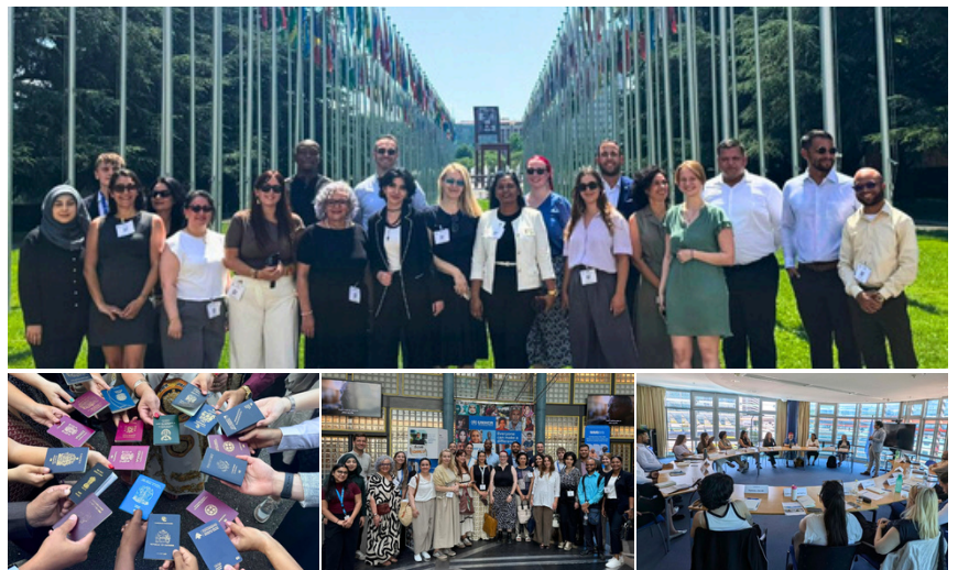
Pictured: Students from the joint UPEACE–UNITAR programs during their academic visit to Geneva and in sessions with representatives from the United Nations, WTO, WIPO, and ICRC.

UPEACE Champions Environmental Activism Alongside UN Costa Rica