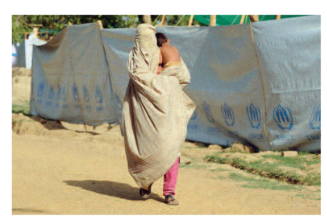
Jalala camp for IDP's fleeing the fighting in Swat. The camp consists of 900 tents spread over 50 hectares with room for about 1200 families (24,000 people). They were forced to flee their homes in the Swat valley following a breakout of violence between the Taliban and government forces. Almost two million people have fled the fighting, Jalala, Pakistan.