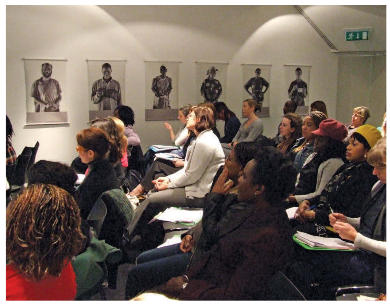
Participants at Akidwa Seminar 'Situations of Women in Armed Conflict: Resistance, Actions and Survival', October 2009